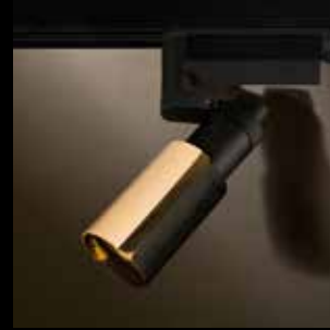
NELSON TRACK 545