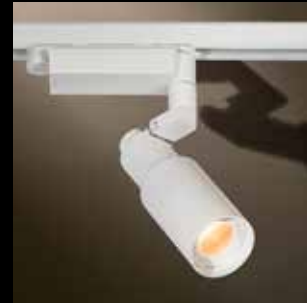
TELESCOOP TRACK 544