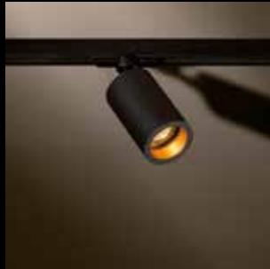
SPINA ELBOW 538