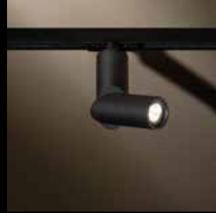
MINI SCOOP 542