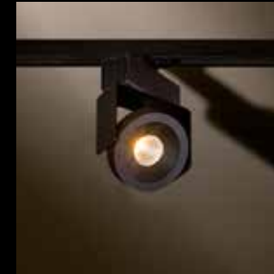
WODAN BEAUFORT 2 528