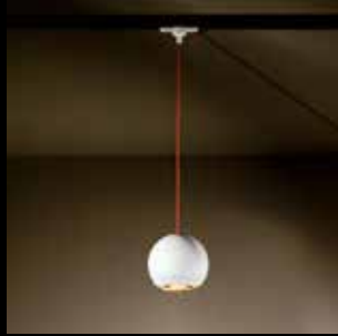
BERRIER PENDANT 535