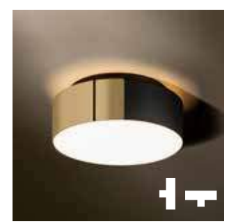
ROLLO SURFACE 212