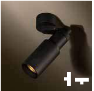
TELESCOOP SURFACE 222