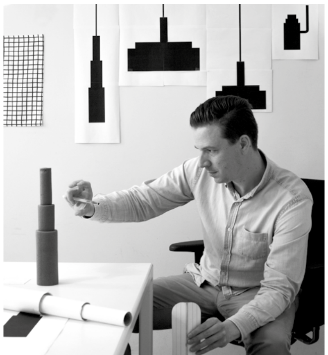
∢ ROLLO SUSPENDED TEXT. WHITE + BRASS