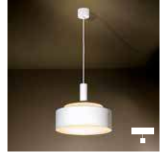
HUBBLE SUSPENDED 303