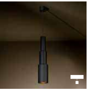
TELESCOOP SUSPENDED M10 286