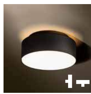
HUBBLE SURFACE 215