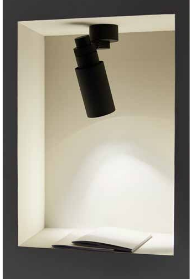
◀ TELESCOOP SUSPENDED TEXTURED BLACK