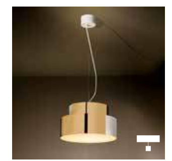
ROLLO SUSPENDED 302